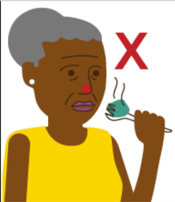
Loss of taste or smell.